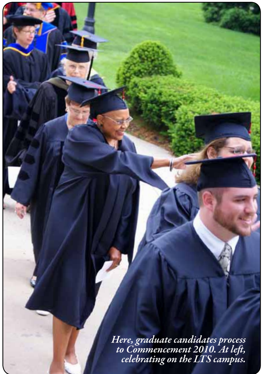
Here, graduate candidates process to Commencement 2010. At left, celebrating on the LTS campus.